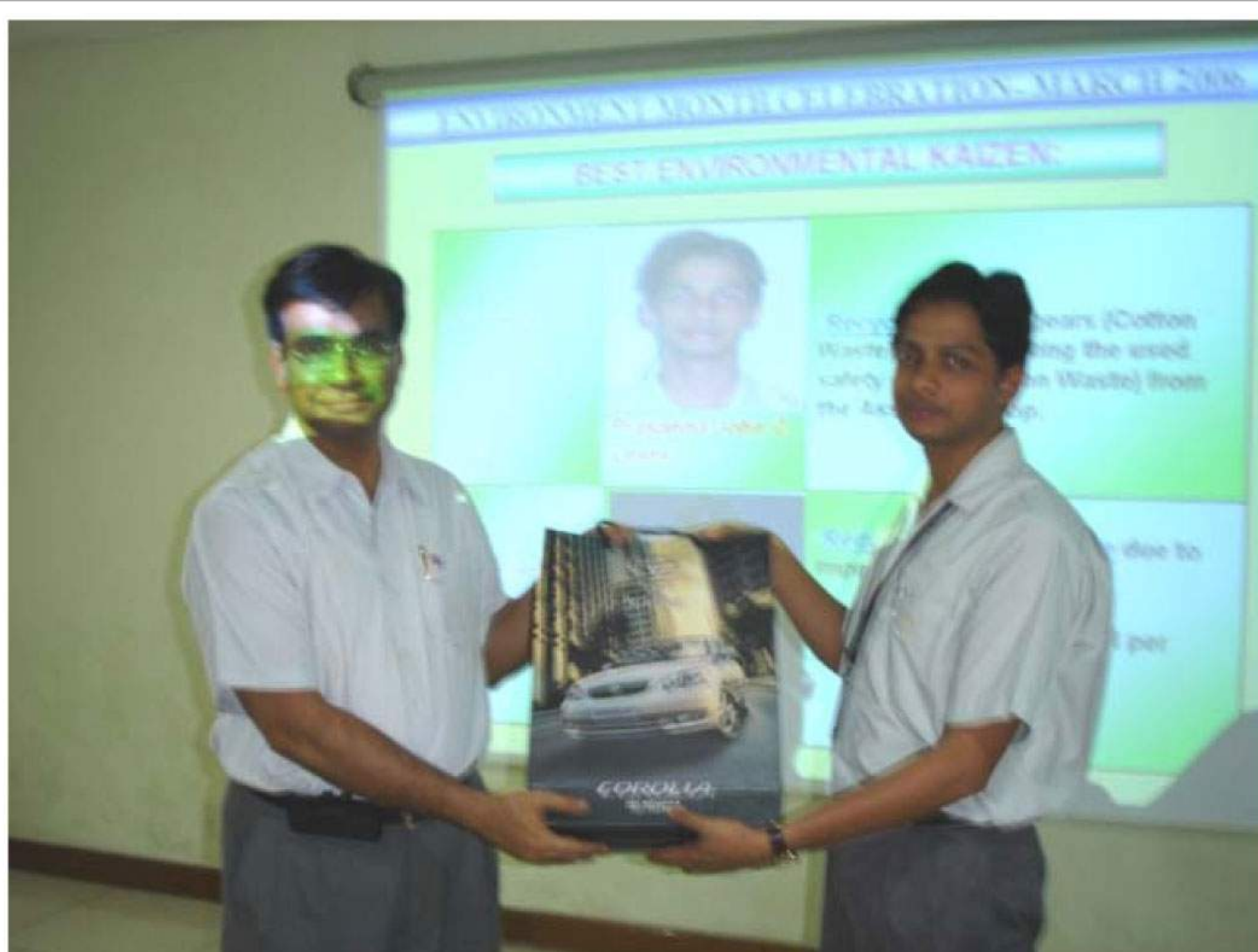
Fig 15 : Team member receiving “ Best Environment Kaizen Award ”