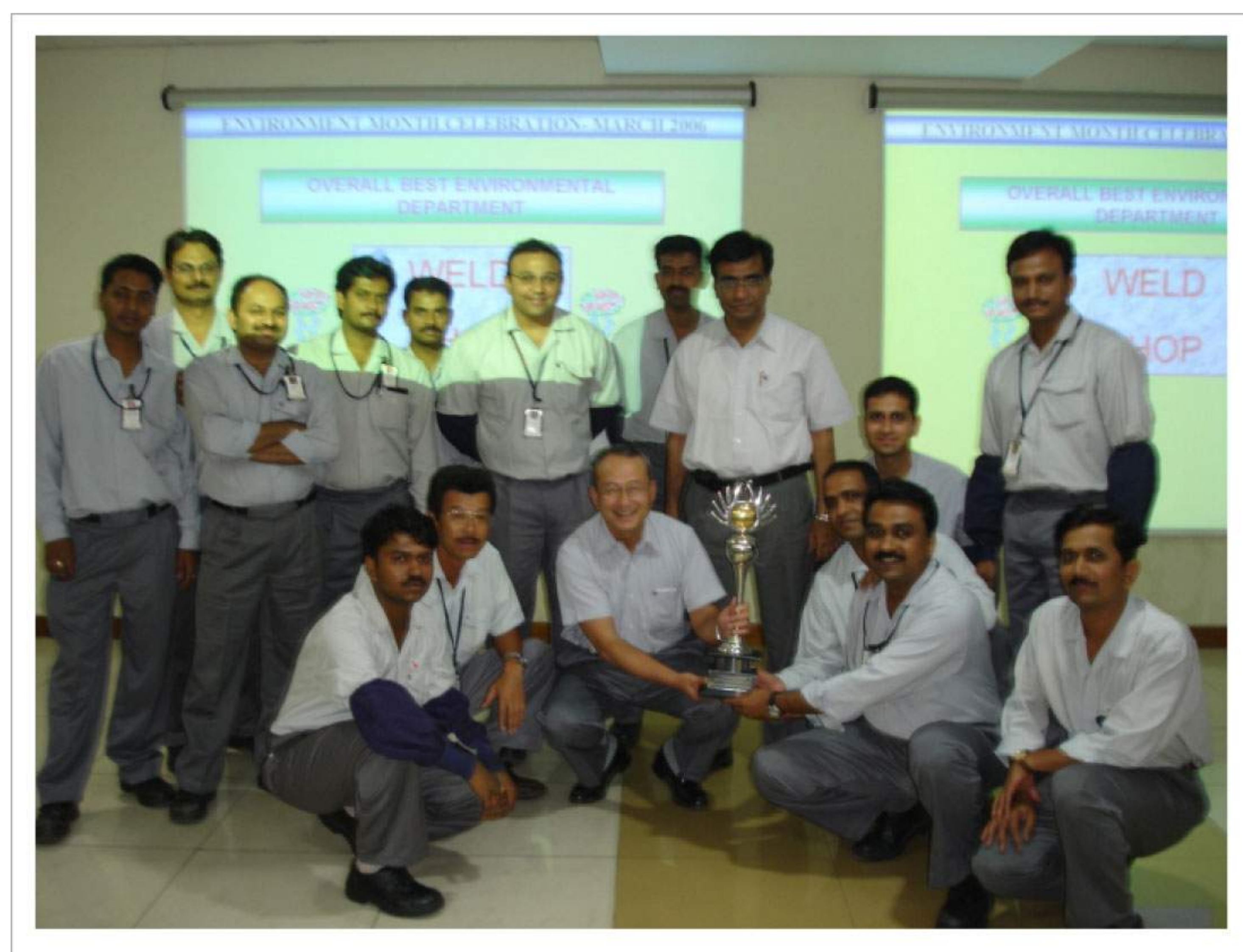
Fig 17 : Weld shop receiving “ Best Environment maintained Dept. Award ”

The basic idea behind these activities was to discover the hidden capabilities inside team members towards protecting the valuable resource.... “OUR ENVIRONMENT”