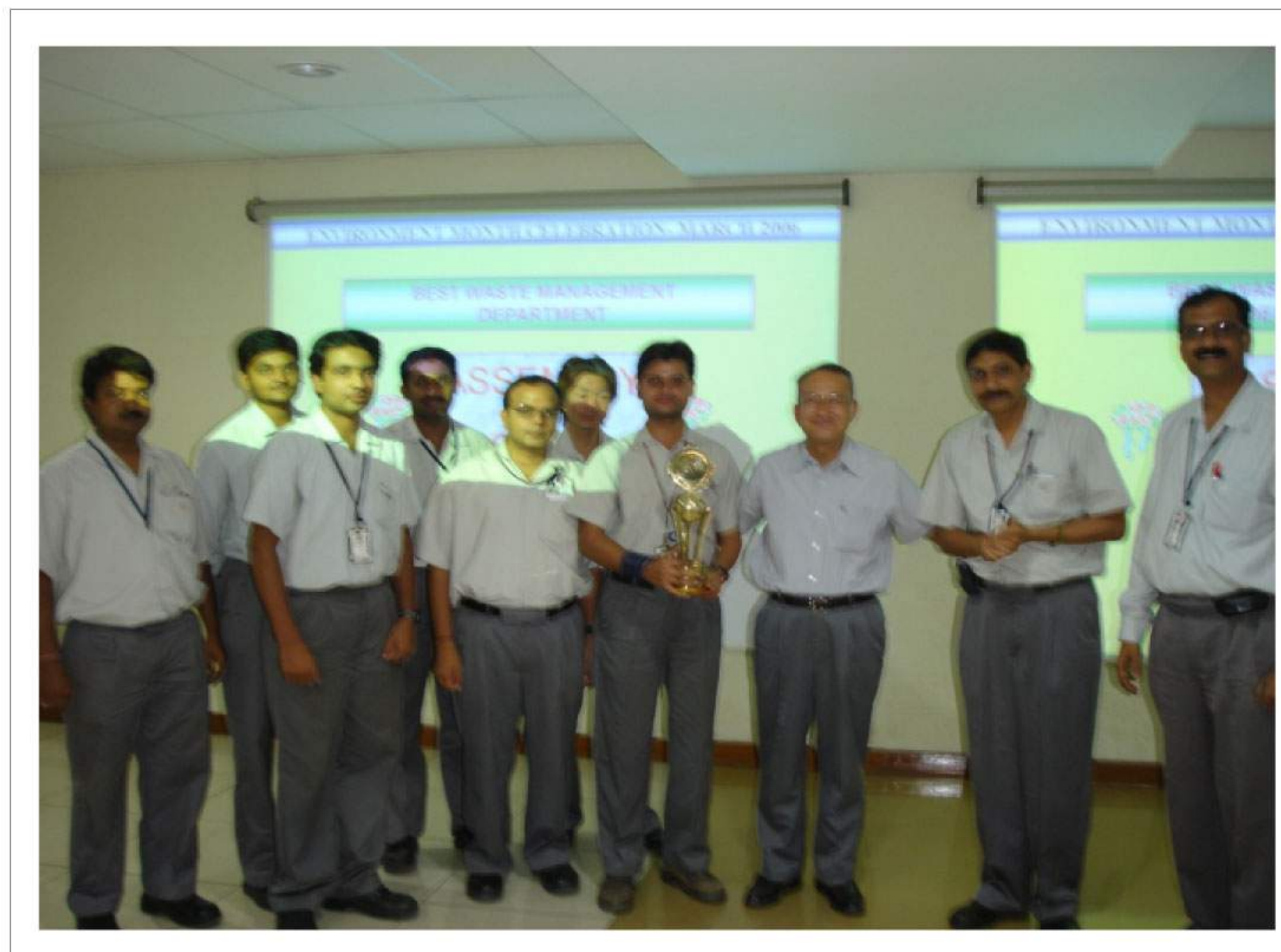
Fig 16 : Assembly shop receiving “ Best Waste management Dept. Award ”