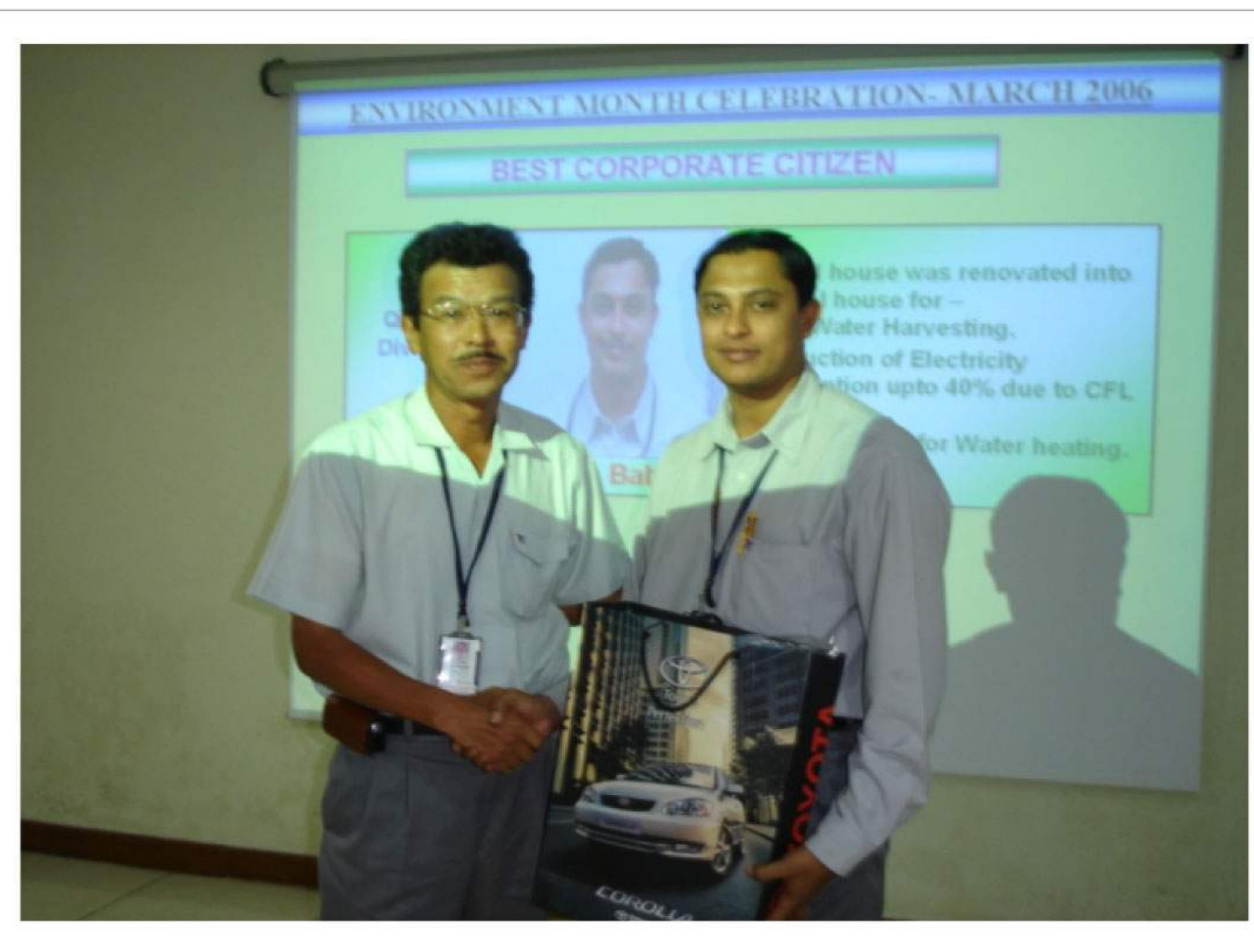
Fig 14 : Team member receiving “ Best Corporate Citizen Award ”