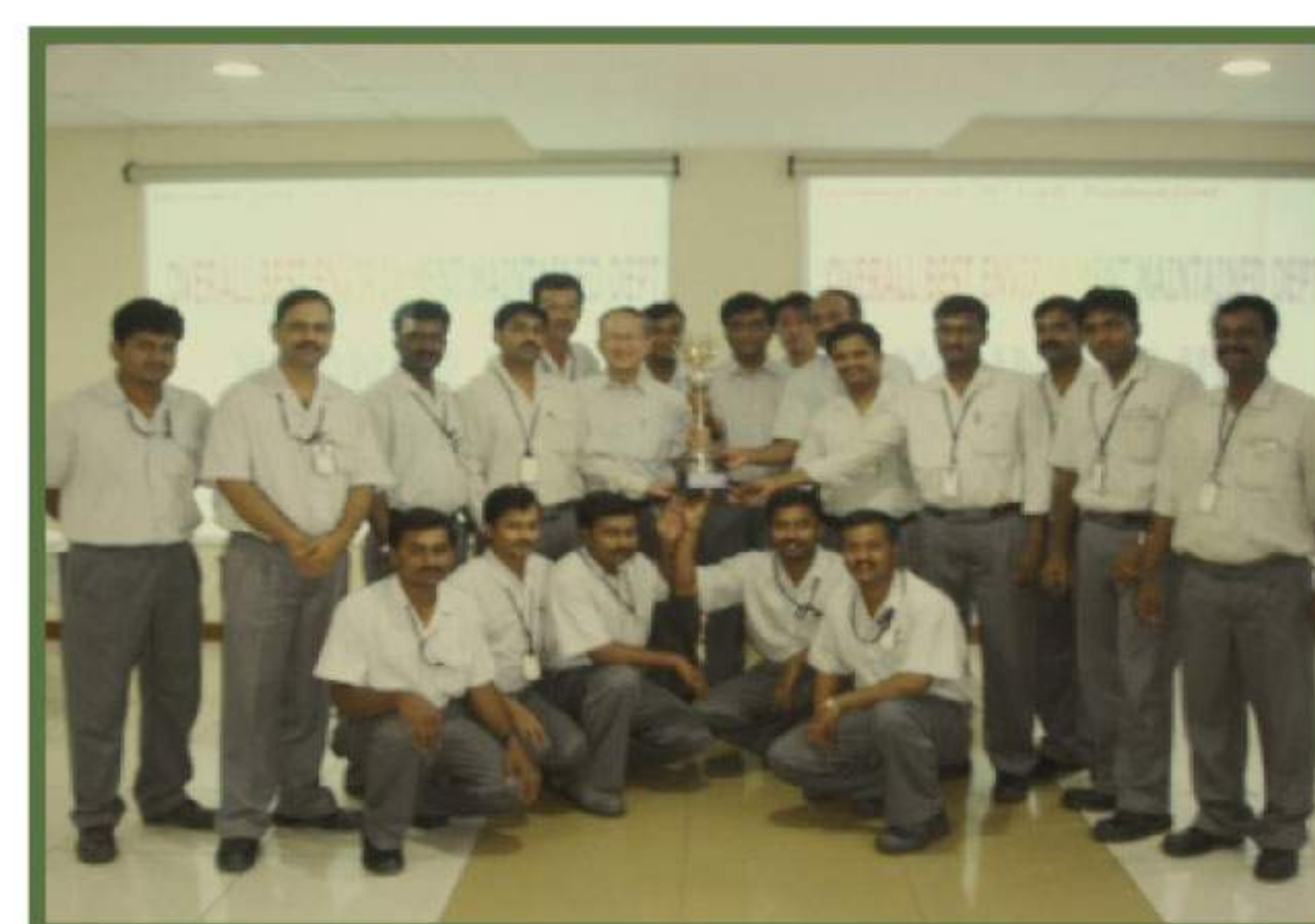
3. Paint Shop Overall Winners