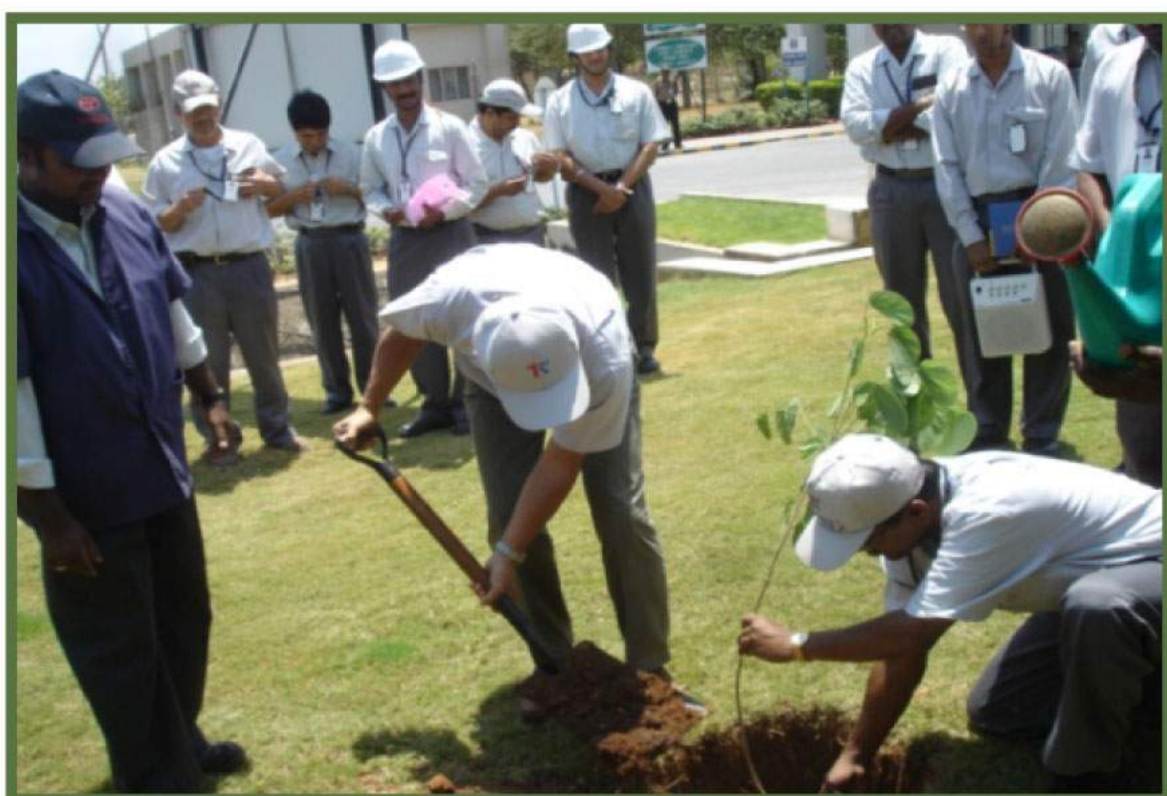
Fig 6.5 : Tree Plantation by MD San