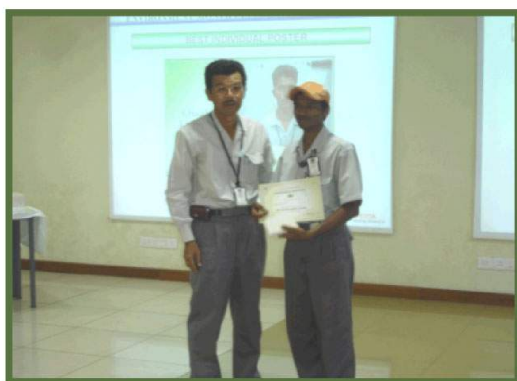
Winner Best Env Poster