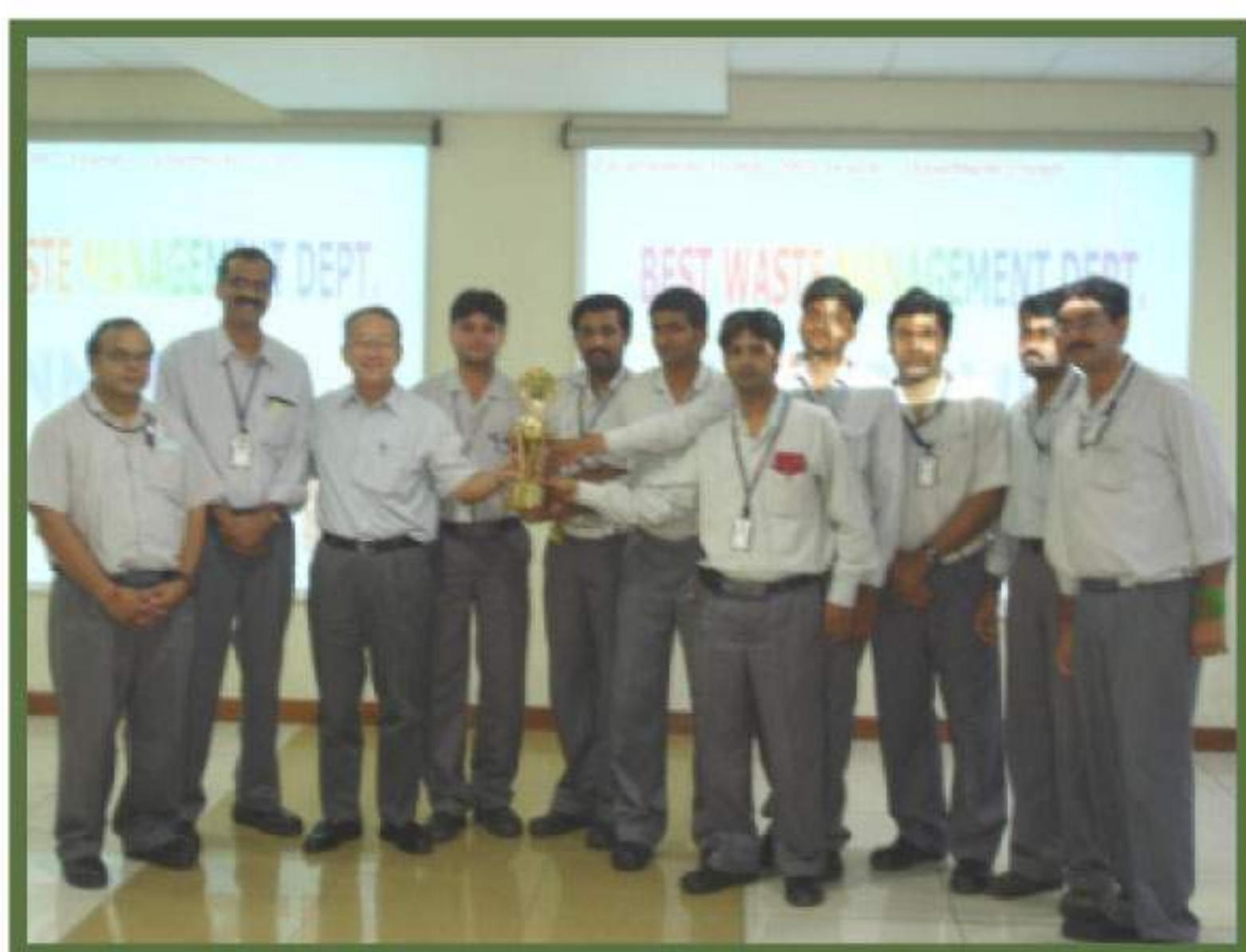
1. Assembly - Winners