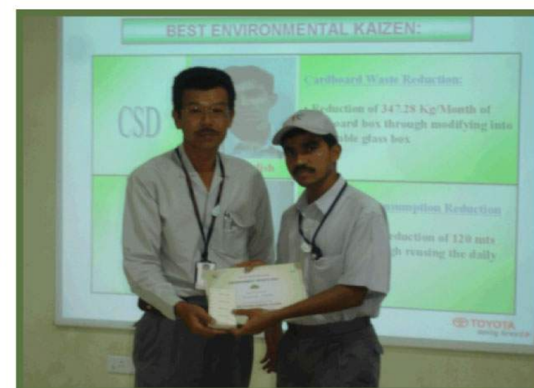
Winner Best Corporate Citizen