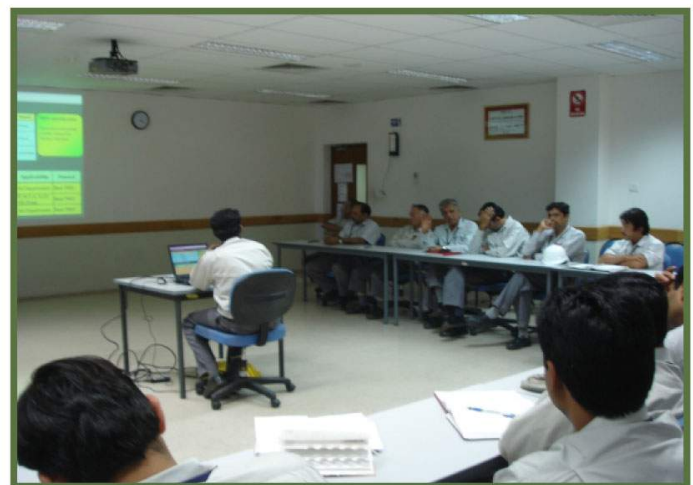
Fig 6.3 : Training to Managers