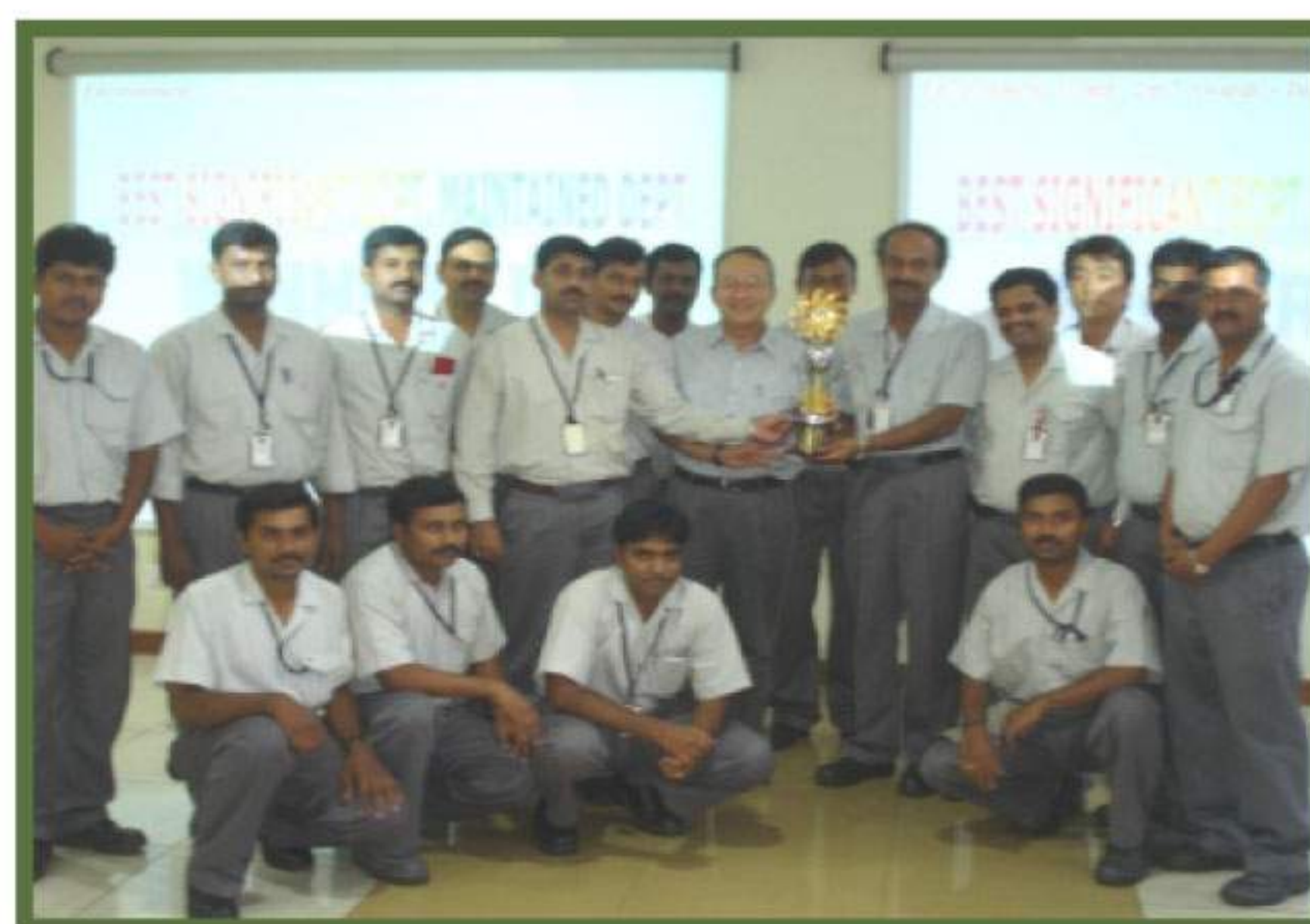
2. Paint Winners