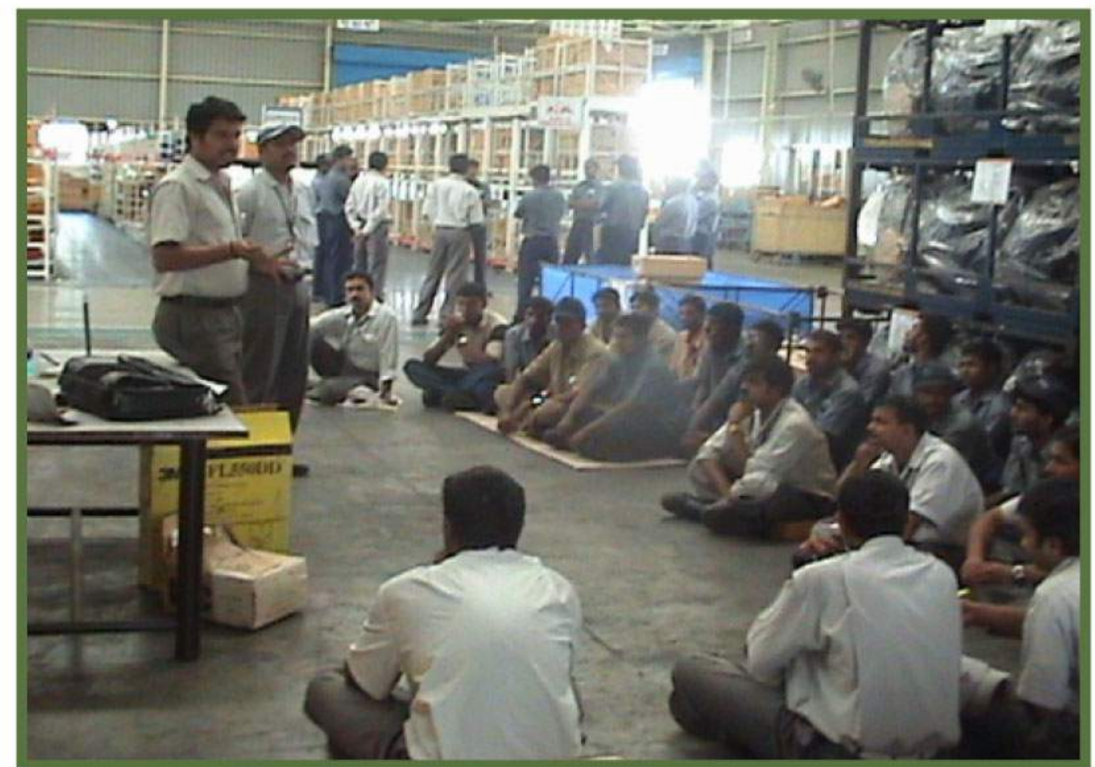
Fig 6.2 : Training to TM's on Environment

Recognizing the environmental education and training as well as awareness-promotion activities are essential for promoting environmental undertakings throughout the company and maintaining continuous environmental performance, Exhaustive training material on environmental issues was prepared and distributed among the shop managers & environment core-team.