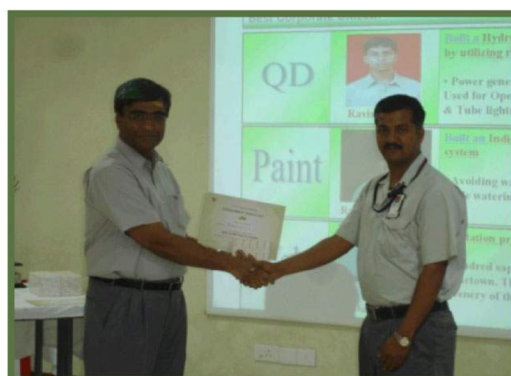
Winner Best Env Kaizen