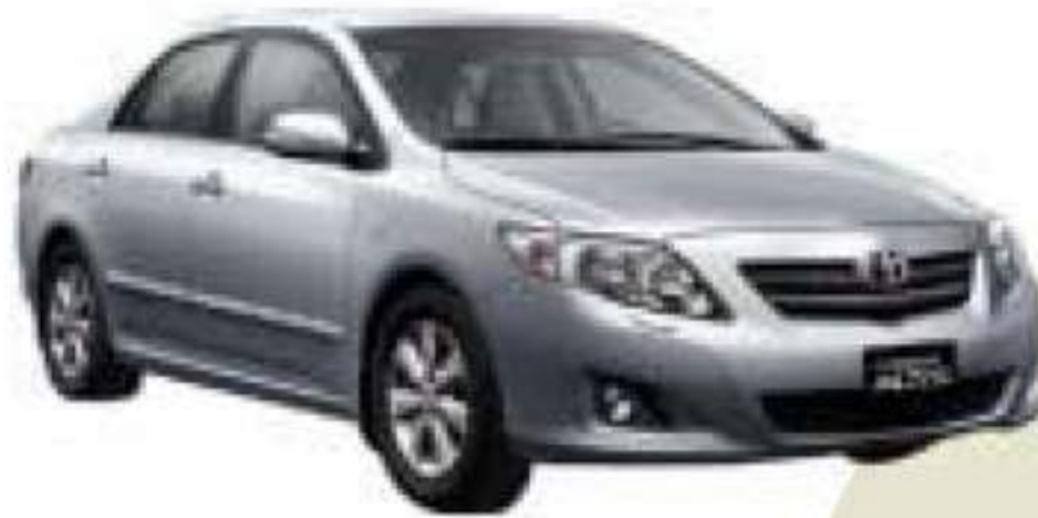
● Corolla Altis Genius Inside - Gorgeous Outside