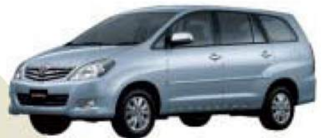
● Innova Drive to precious times