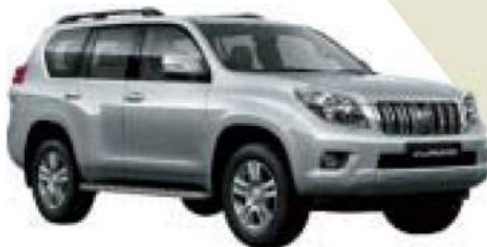
● Prado All-terrain Luxury