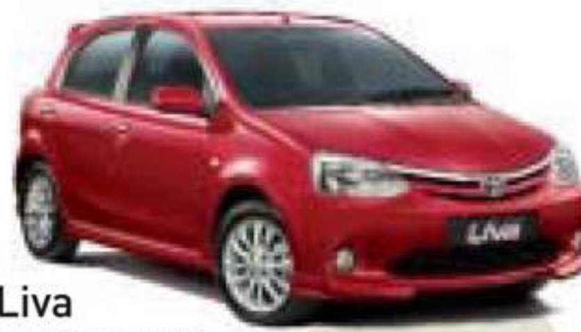
● ETIOS Liva QClass HATCH: LIVE TOMORROW TODAY.