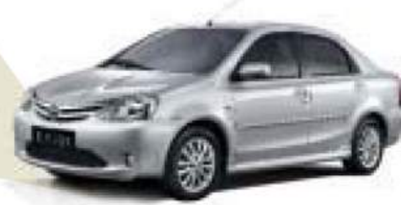
● ETIOS QClass: World First, India First ...My first