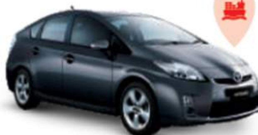
Prius Planet's Favorite Hybrid