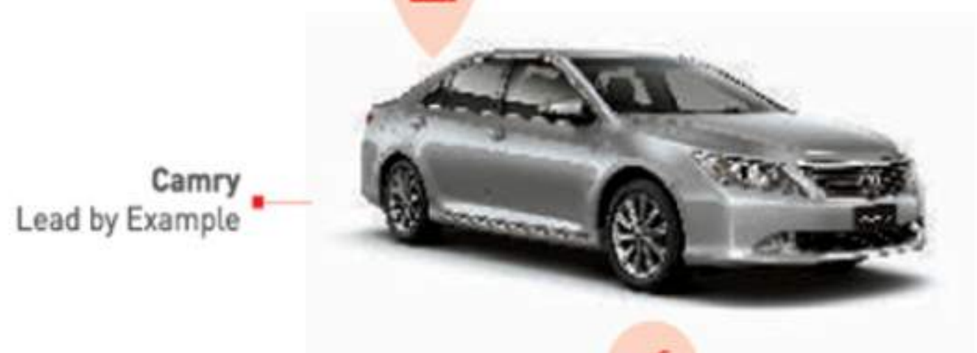
Camry Lead by Example