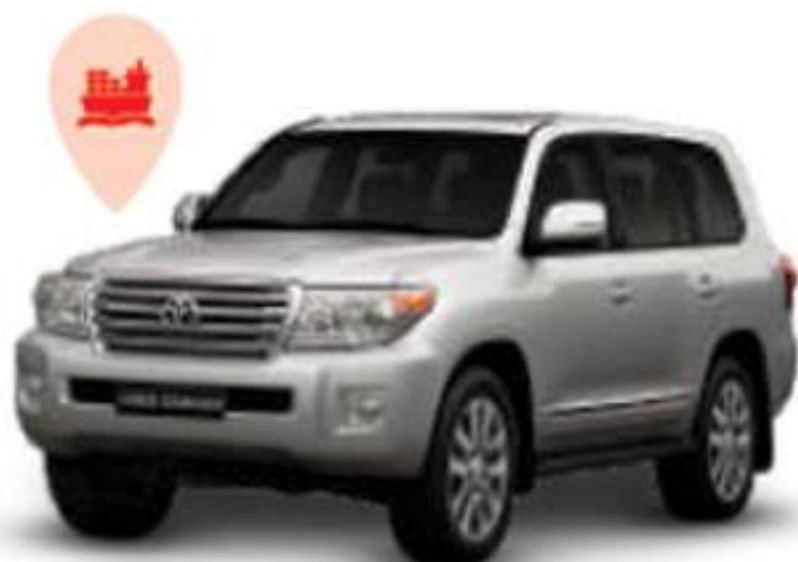
Prado All Terrain Luxury