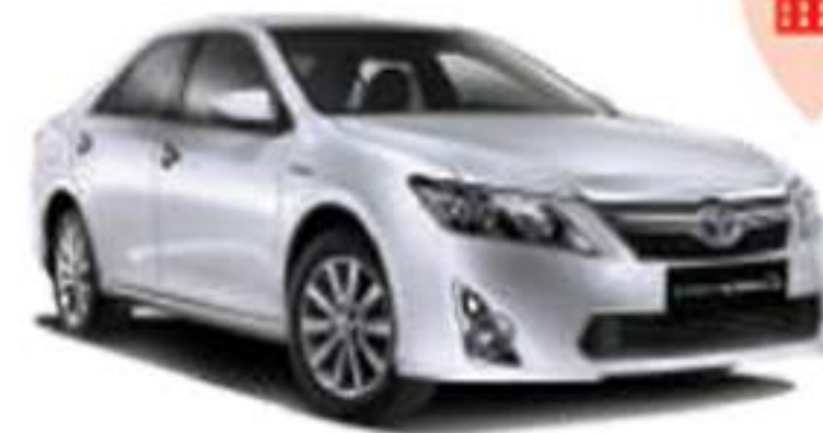
Camry Hybrid Thoughtfully Advanced