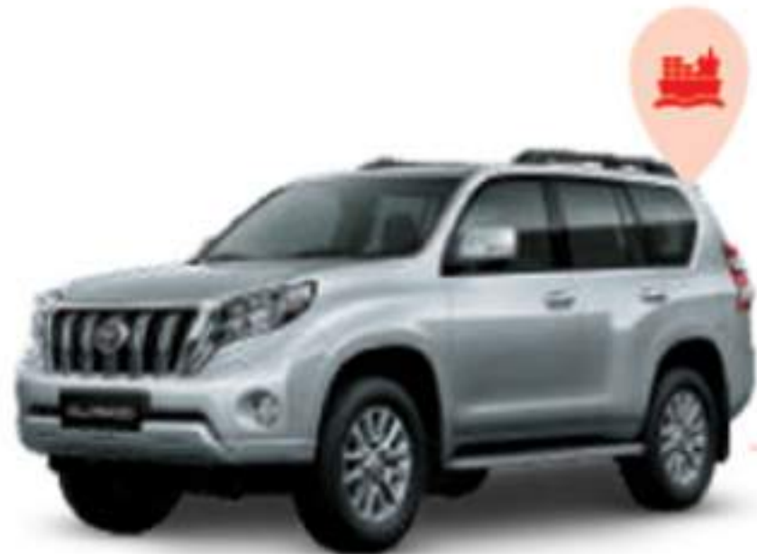
Land Cruiser The Pride of the World