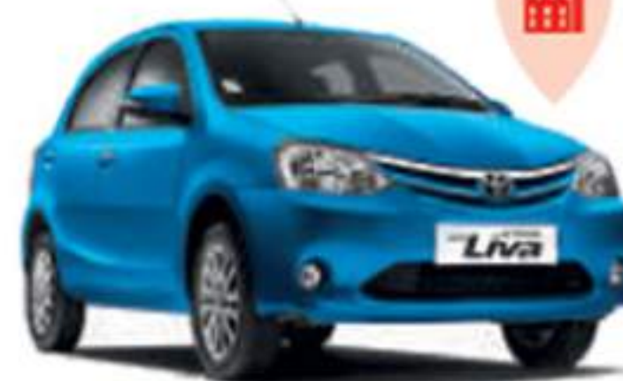
Etios Liva Built on QDR