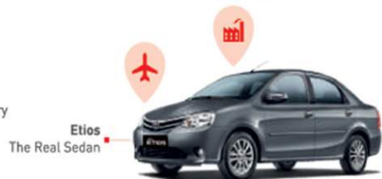
Etios The Real Sedan