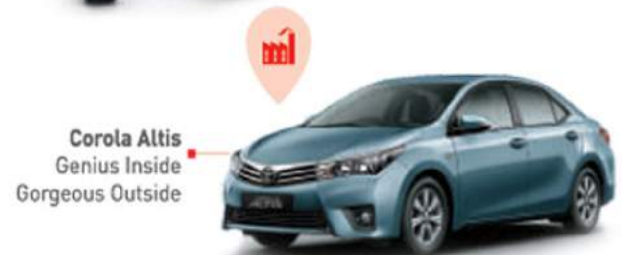
Corola Altis Genius Inside Gorgeous Outside