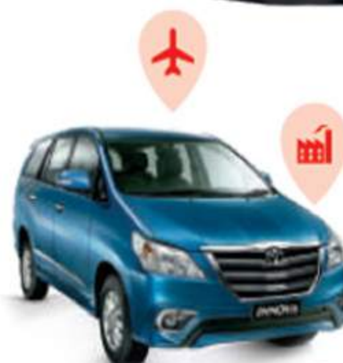
Innova Multi Premium Vehicle