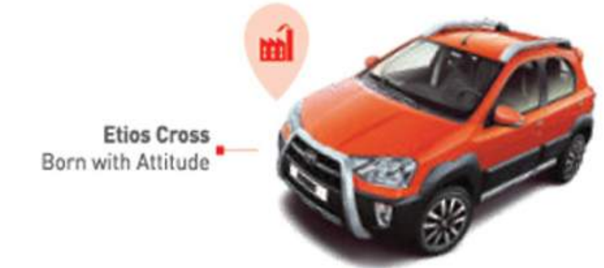
Etios Cross Born with Attitude