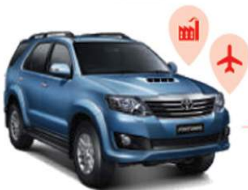
Fortuner The Art of Power