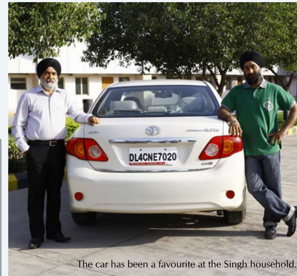
The car has been a favourite at the Singh household.

The sunglasses holder is a much-loved feature, with both brothers arguing about who gets to keep the shades in.