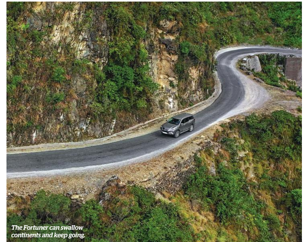
The Fortuner can swallow continents and keep going.

Our off-roading jaunt means we drive into Kufri later than expected. It is evening, and a magical one. Golden sunlight bounces off the peaks, there is a chill in the air, and town's market is bustling. Kufri is famous as a skiing destination, but there are other delights too. The little village of Fagu, a quick drive away from Kufri, is one of them. Located off the Hindustan-Tibet Road, it