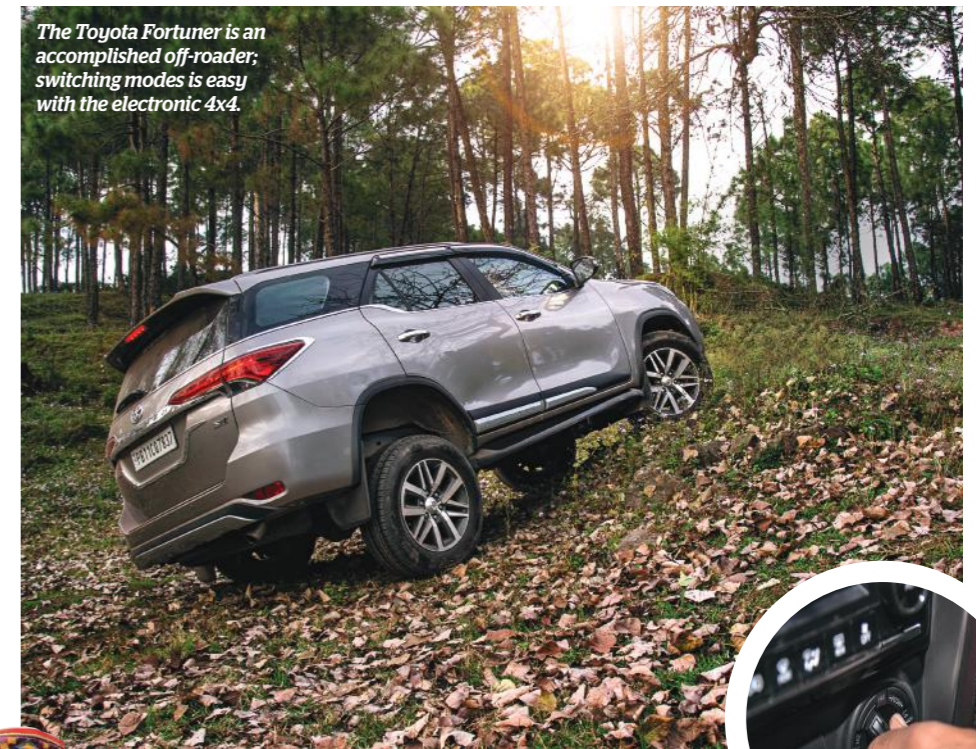
The Toyota Fortuner is an accomplished off-roader; switching modes is easy with the electronic 4x4.