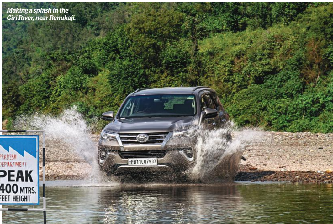
Making a splash in the Giri River, near Renukaji.

Driving up from Chandigarh, early in the morning towards Kufri in brilliant sunlight, it is clear why the Fortuner appeals to individuals and families alike. The SUV rides nice and high, the interiors exude quality, and the engine - in our car's case, the 2.8-litre diesel - feels like it