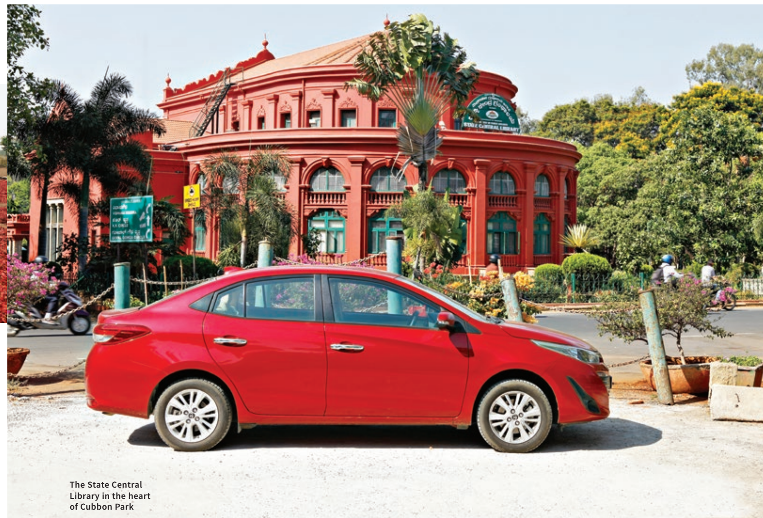
The State Central Library in the heart of Cubbon Park