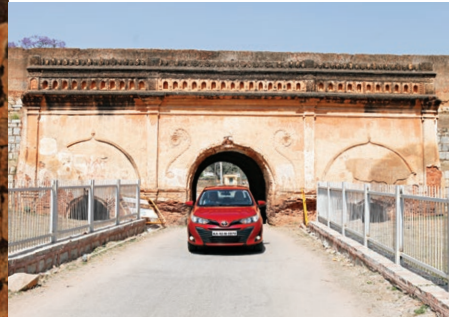
(Left) The Devanahalli Fort is Tipu Sultan's birthplace and the first stop on our drive