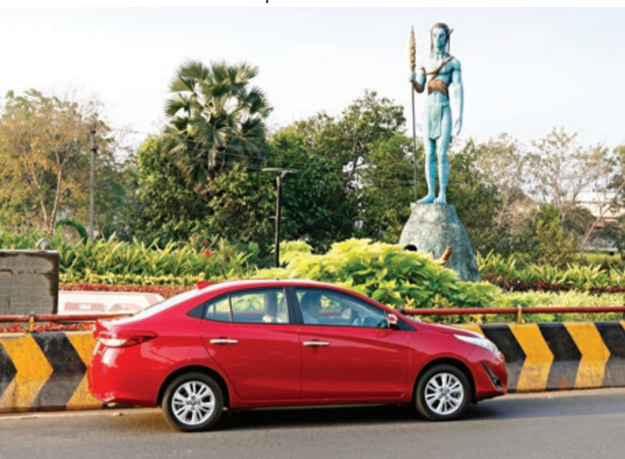
(Left) The Avatar statue in Vijayawada are super cool