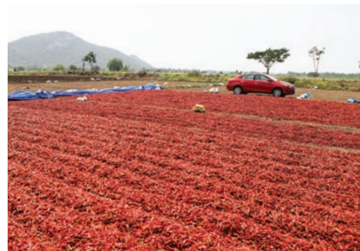
(Below) Chilli is a popular produce of the region

earnest. The biggest attraction (literally) in Amravati is the Dhyana Buddha statue. This 125-foot statue of the Buddha is essentially one of the most elaborate roofs to a structure you will ever see, because the base of the statue houses a museum on Buddhist culture. The sunlight bouncing off the serene, soaring white statue was perfectly balanced by the almost glowing Wildfire Red shade of the Yaris. I also checked out the mighty Krishna River gurgling nearby before heading out of Amravati and towards the other side of the River's bank and the famous town of Vijayawada.